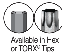
Available in Hex or TORX® Tips