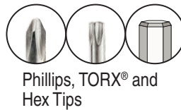
Phillips, TORX® and Hex Tips