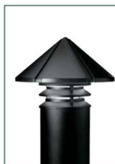
15221 Large Conical