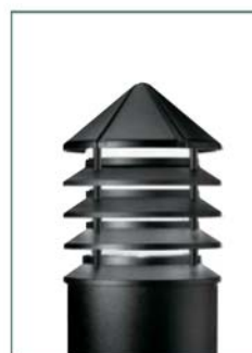
15215 Small Conical