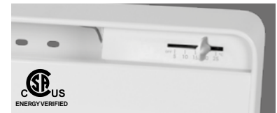
ULTRA-PRECISE ELECTRONIC THERMOSTAT (OPTIONAL)