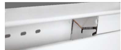
THERMAL PROTECTION HIDDEN INSIDE THE JUNCTION BOX