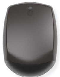
with photocell (dark bronze)