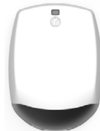
with photocell (white)