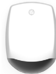
without photocell (white)