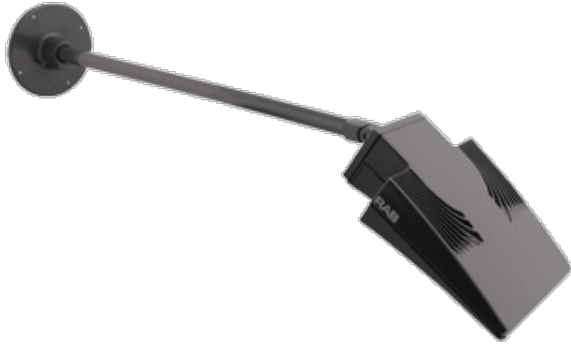
Mounting arm for LED Wallpack