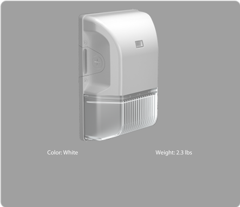
Color: White Weight: 2.3 lbs