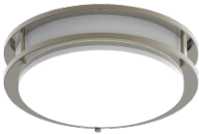
Color: White w/brushed nickel ring Weight: 2.5 lbs