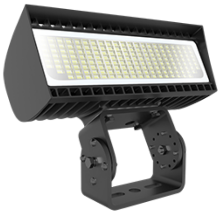
Color: Bronze Weight: 20.2 lbs