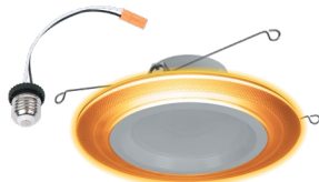
RL Night Light