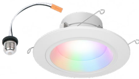
RL Smart Wi-Fi