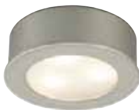
Shown as surface mounted.

for in-cabinet and undercabinet installations. The fixtures are longlasting with a potential life of 50,000 hours and thermally efficient for illuminating sensitive perishables and UV sensitive apparel, artwork and collectibles.