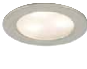
Shown as recessed mounted.