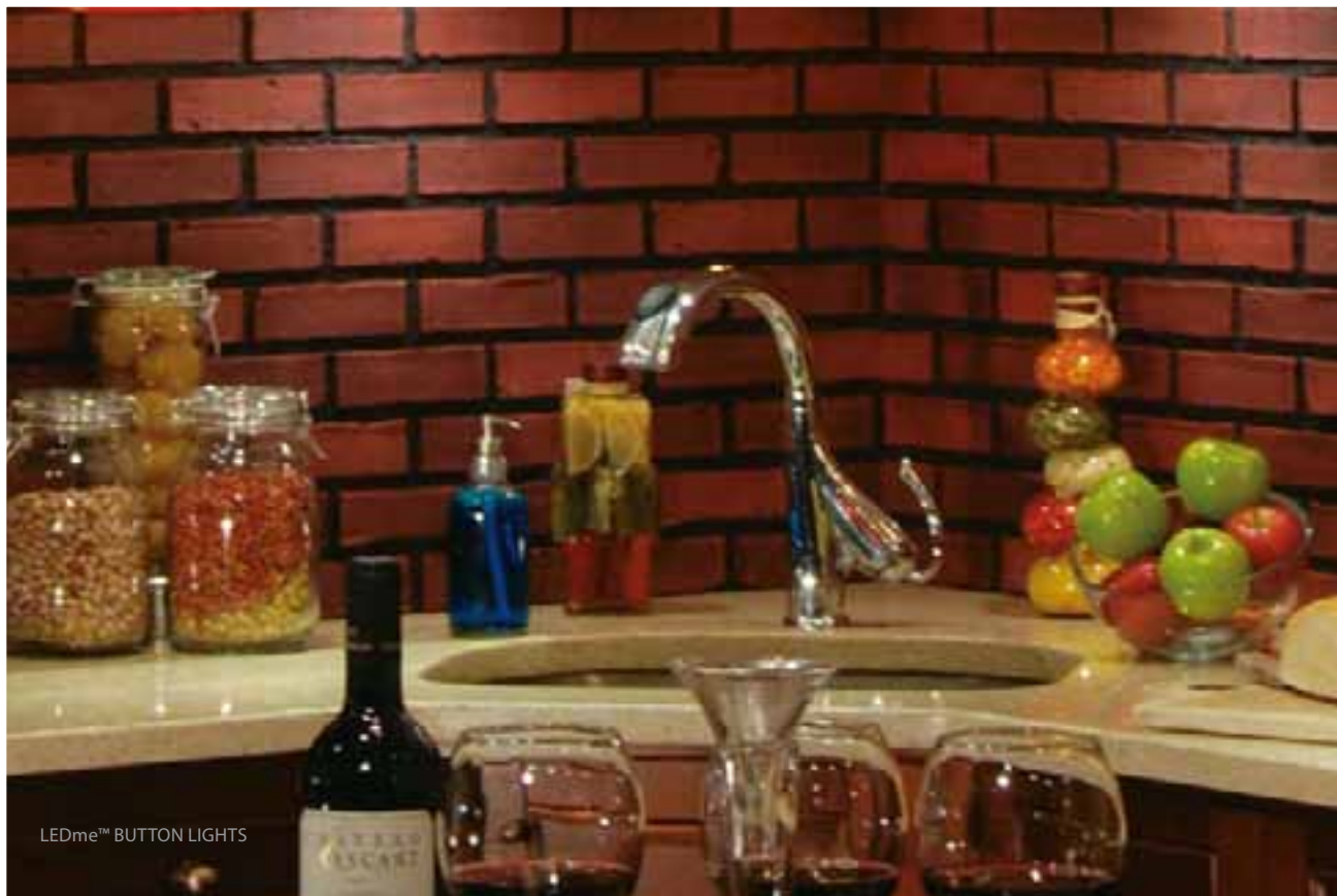
LEDme™ BUTTON LIGHTS

WAC LEDme™ Button Lights deploy strong illumination for effective residential, retail and light commercial displays. Ideal for kitchen counters, curios, etageres and cabinets, LEDme™ Button Lights can be recessed or surface mounted