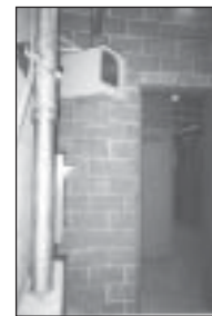
Freeze/Moisture Protection in a Generator Vault

the highest quality components custom designed for use in the KB Series Unit Heater.