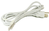
72" Cord & Plug

NUA-804B Black NUA-804W White Used to hardwire NUDTW-88 fixtures to NUA-802 or junction box (by others). Finish: Black or White