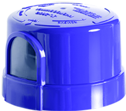
Weight: 0.2 lbs