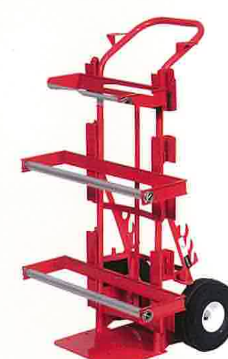
BSC2H1C2D Wt 65.3 lbs