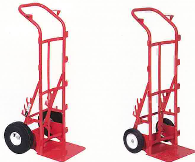
BSC2H Heavy Duty Cart