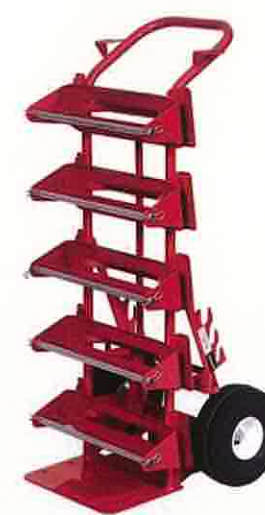
BSC2H5A Wt 61.25 lbs