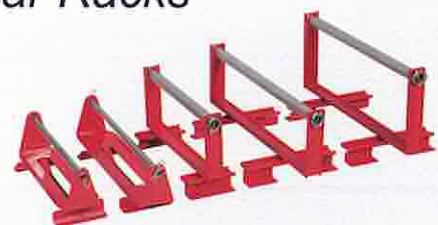
R17A, R22B, R17C, R25D, R24F