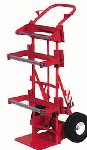
BSC2H1A2C Wt 51.05 lbs