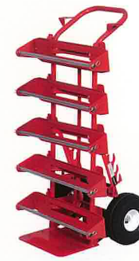
BSC2H5B Wt 66.25 lbs