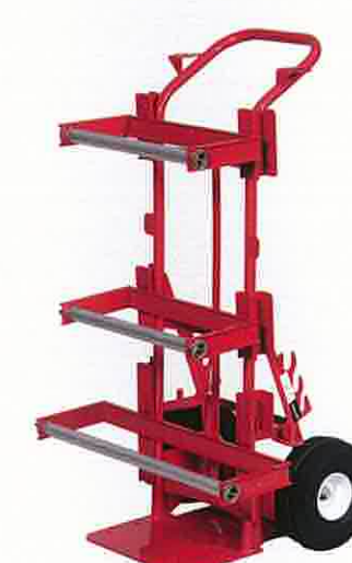
BSC2H2C1D Wt 60.5 lbs