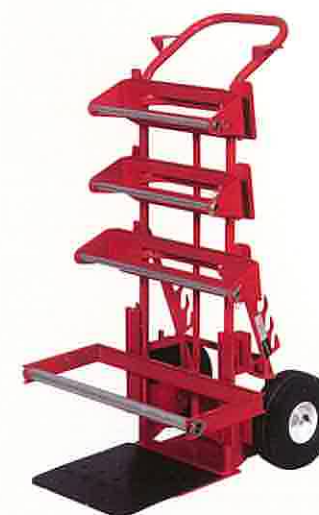
BSC2H2A1B1FEBP (Heavy Duty Only) Wt 85.5 lbs

Standard configurations offered below or customize your own. To customize, carts, racks, and accessories must be purchased separately.