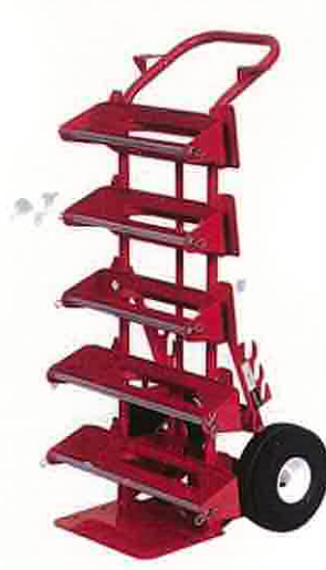
BSC2H3A2B Wt 63.25 lbs