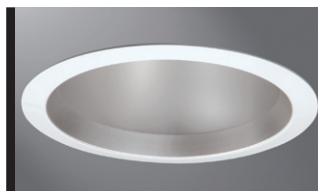
ERT770MTS White Trim, Matte Haze Reflector