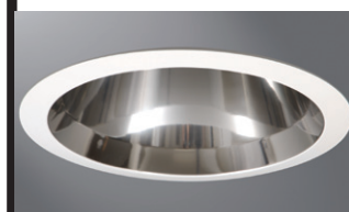
ERT770TS White Trim, Clear Specular Reflector