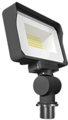
Color: Bronze Weight: 0.8 lbs