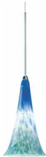
Shown with G614 Shade