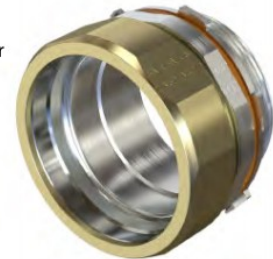
RT Compression Connector