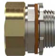
Furnished with a UL Listed Steel Locknut Sealing Washer